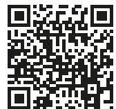
Student Spotlight: Klara Mahaos