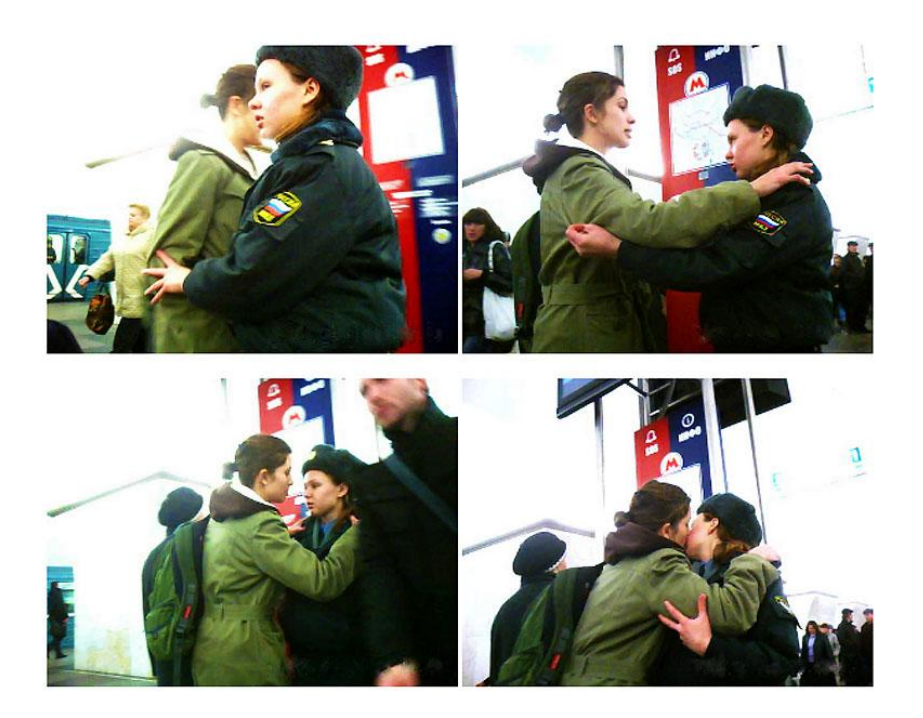
Fig. xi. Voina, Lobzay Musora (Video), 2011

unjust court system, Putin, against everything evil (Babitskaya). However, both art groups were also fighting for the rights of the Russian LGBTQ+ community with their artworks. Voina, dor instance has joined the campaign in support of Russian Gay Pride by releasing a series of banners featuring the 2011 Moscow Pride and their artwork called, Lobzay Musora (Kiss the Pig), where female Voina artists were kissing policewomen in Moscow underground (Fig. xi).