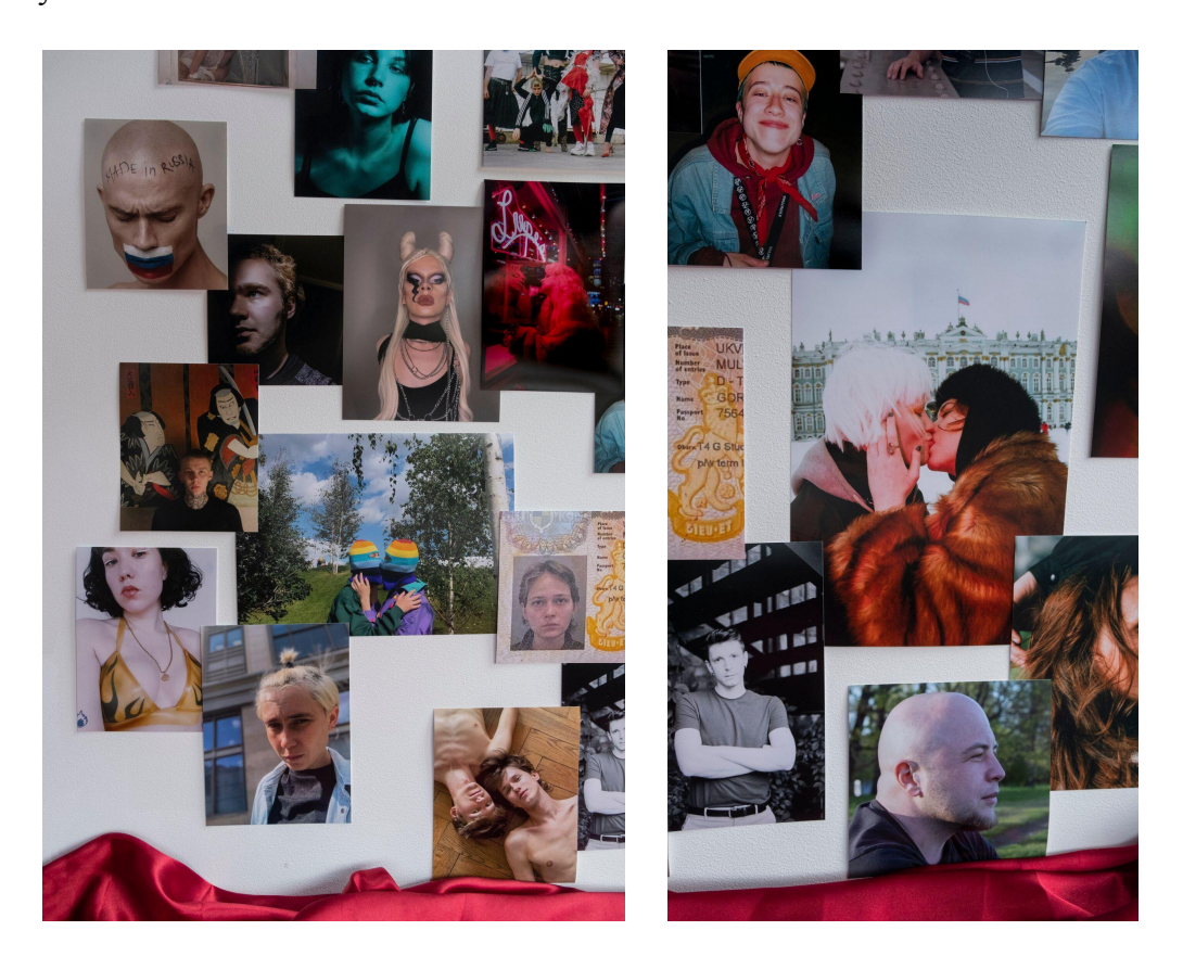
Fig. xii. Russian Queer Revolution exhibiton in London, 2020

is still misunderstood, unrepresented, and silenced, but at least now it is often met with curiosity and not abuse.