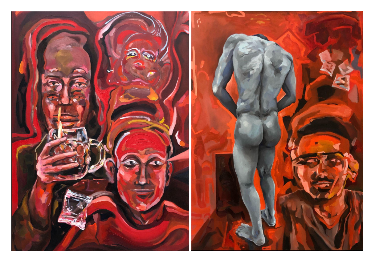
Fig. xvi. Sasha Vitov (Alexandr Melnikov), One Long Night , (Oil on Canvas), 2020 Fig. xvii. Sasha Vitov (Alexandr Melnikov), One Night After , (Oil on Canvas), 2021

The color palette for the whole series of paintings and installations is intentionally kept between blue and red undertones, as both colors are embodied in the Russian queer culture. As mentioned earlier, in pre-revolutionary Russia, ties or napkins of the scarlet tone of red ( aliy ) was a hidden sign for others that this particular individual is homosexual. Furthermore, the neon red is often implemented at underground techno rave events that are a commonly safe zone for the LGBTQ+ community, as they were first created by marginalized black queer communities in the US. The red color symbolizes the sexual energy of these particular events. The techno rave culture ultimately impacts the final art project with paintings such as One Long Night and One Night After .