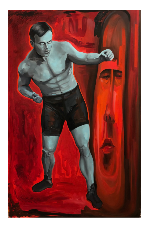
Fig. xiii. Sasha Vitov (Alexandr Melnikov), Fighter, (Oil on Canvas), 2021

Investigating the Russian queer artists, one subject matter always prevails. Artists, such as Konstantin Somov, Slava Mogutin, and Georgy Guryanov depicted fighters in their artworks. One may argue that the reason for such creations was to some extent demonstrate the beauty of male physique, but perhaps, a fighter also symbolyses the Russian queer community. The fight for your own survival in a society that ultimately creates barriers for your failure. Thus, the main subject in the painting, Fighter from the series The Room of Laughter sought its inspiration in this ongoing tradition of the depiction of male fighters.